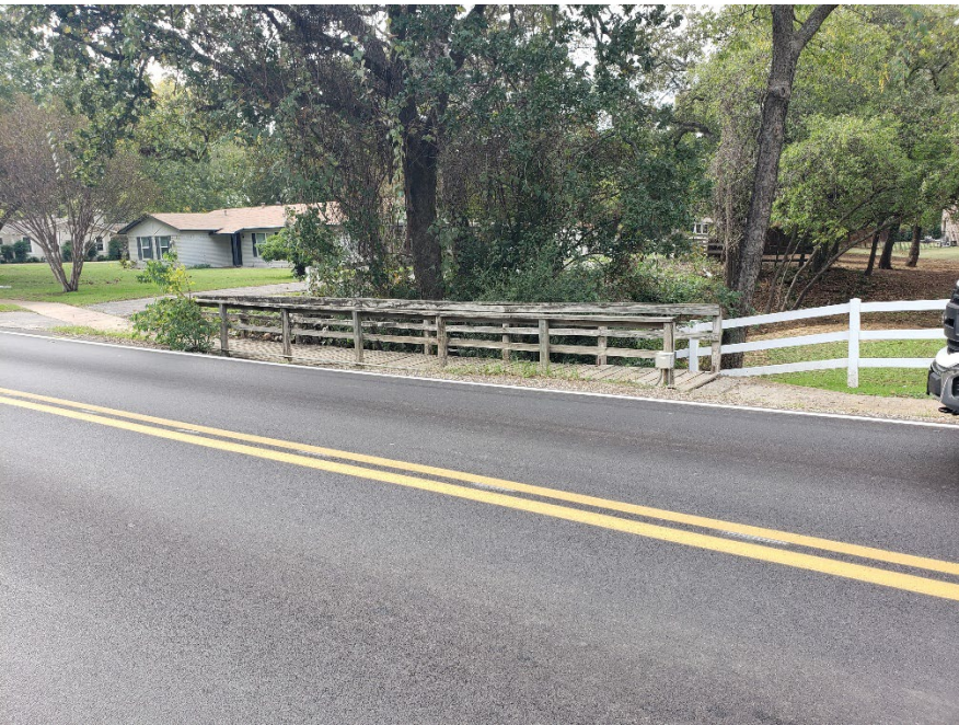
Looking South on Roosevelt (Sidewalk Bridge)