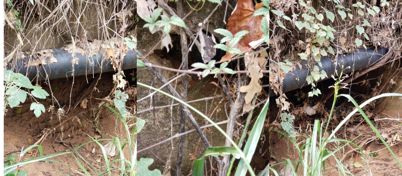
Exposed water line running North and South

This Box culvert needs the vegetation and sediment cleared out for a formal evaluation of the box culvert structure as well as solutions for burying the exposed water line. A box culvert cannot be added at this time as the box culvert is adjacent to the water line. Solution to raise the water line and lay it on top of a box culvert addition?