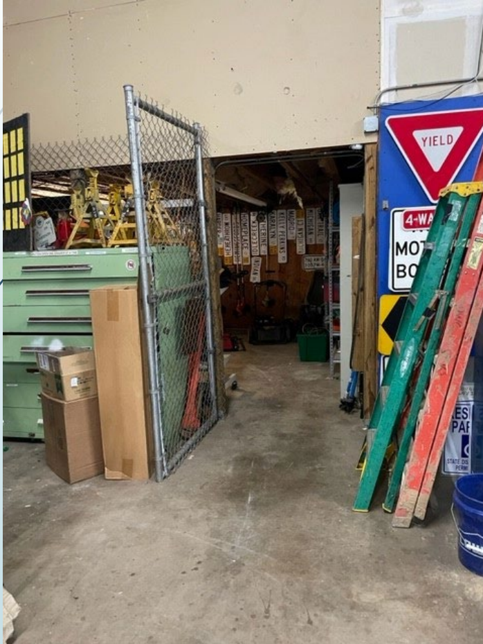
Inside this room