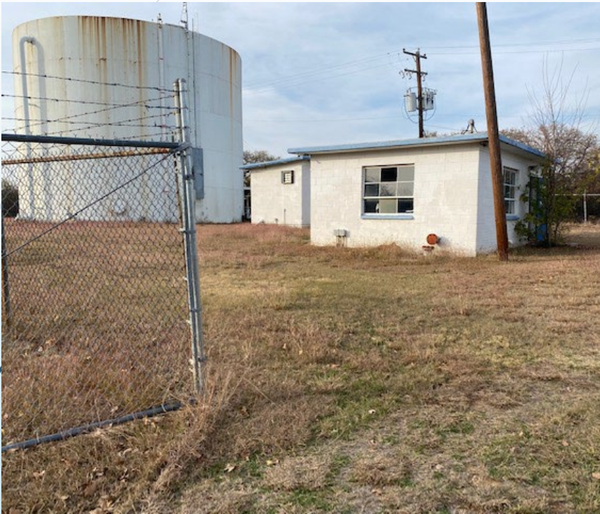
Booster pump station and chlorine room